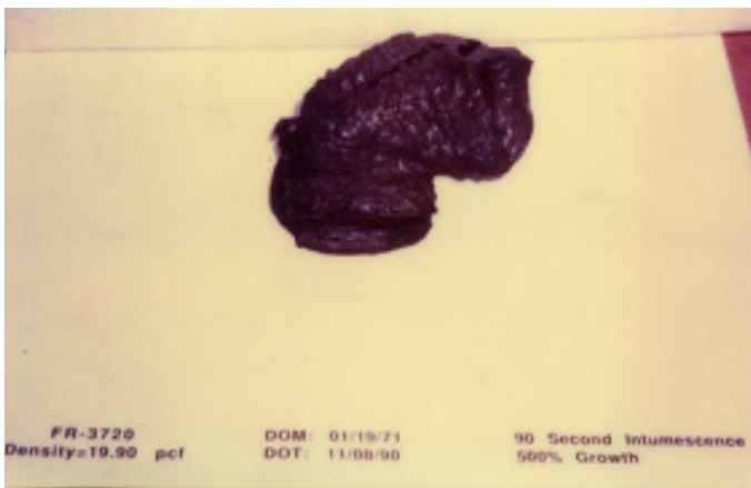
Figure 1: Intumescent-char-forming ability of FR 3720 is not affected by age.

The compressive strength was 1,393 psi with a modulus of 34,968 psi/in. This compares very favorably with General Plastics' published nominal compressive strength values for LAST-A-FOAM® FR-3720 of 1,105 psi and 27,957 psi/in. The higher values found in the 20-year-old sample may be partly due to the 0.5-inch-thick sample vs the standard 1.0-inch-thick, and partly due to long-term cure effects (see Figure 2 on page 6).